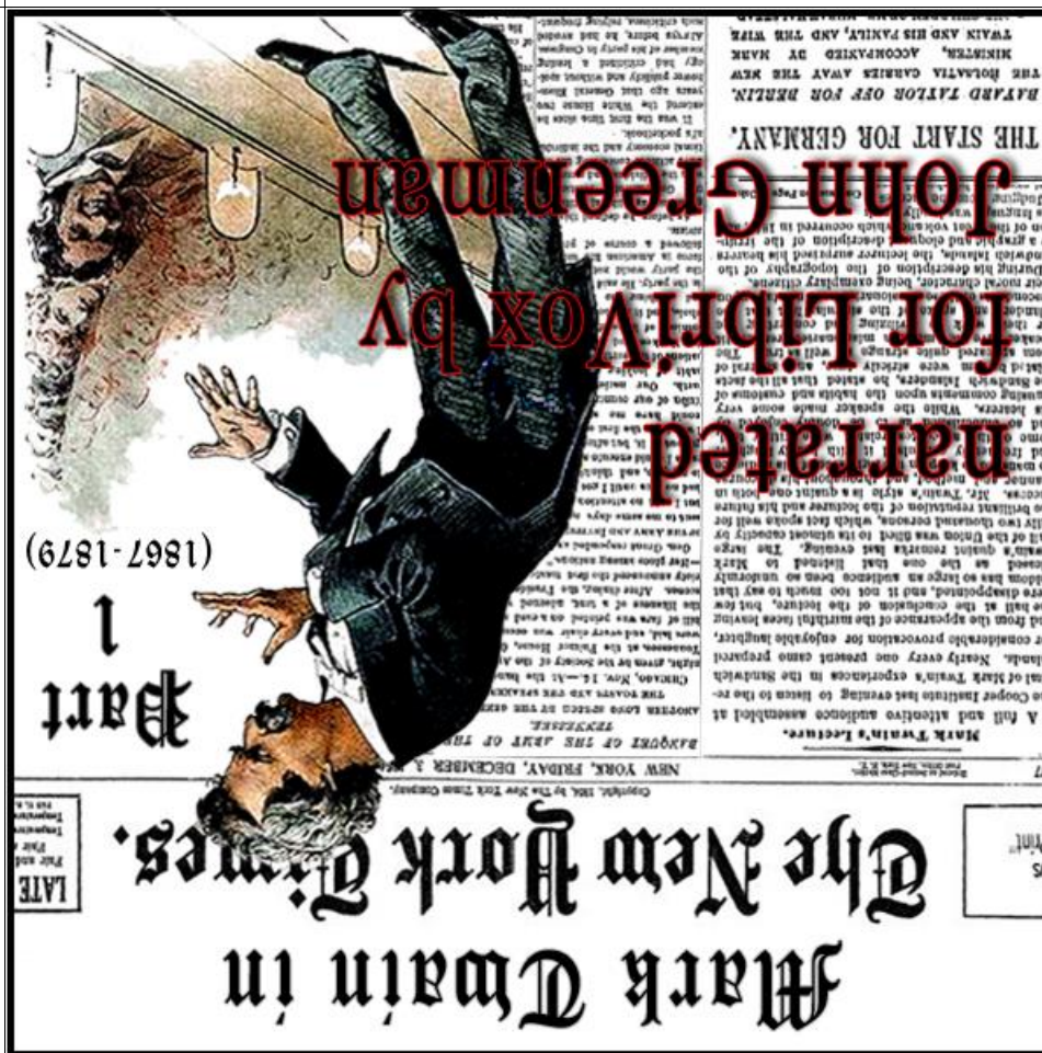
Cover images: Puck Magazine New Series No.1 "Mark Twain," America's Best Humorist; NYT Masthead and various articles re Twain Cover design for Librivox by Michele Fry

Print Page 3 on regular or 20 lb bond paper for ease of folding.